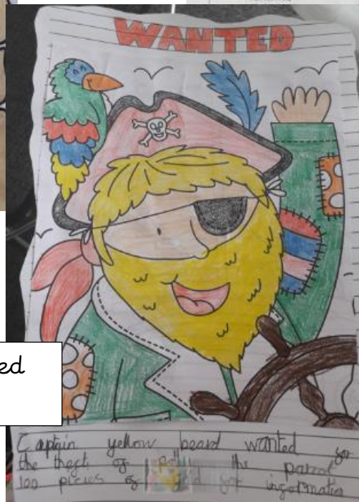
Lewis' wanted poster