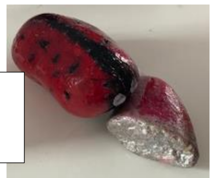
Beau's silver rock for the hope garden