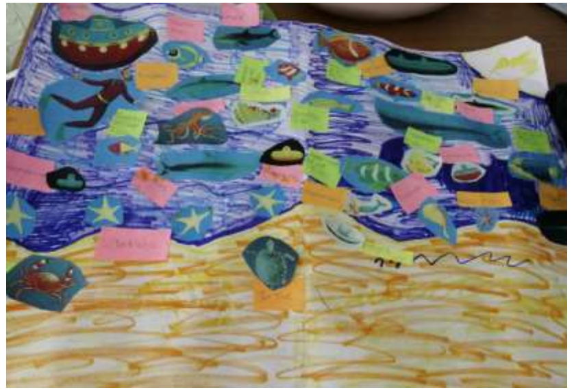
Sophie's writing and Under the Sea picture